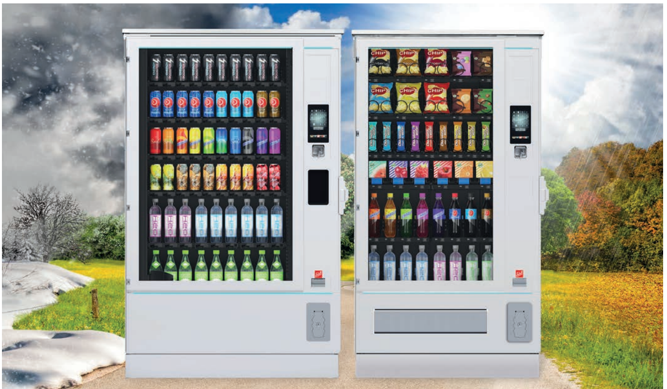
SiLine® GF L RO in Standard colour RAL 9010

SiLine® Outdoor – ready for all weathers, just provide electricity