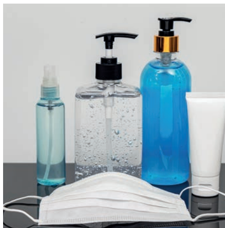
Sell both food and non-food goods, hygiene products etc.