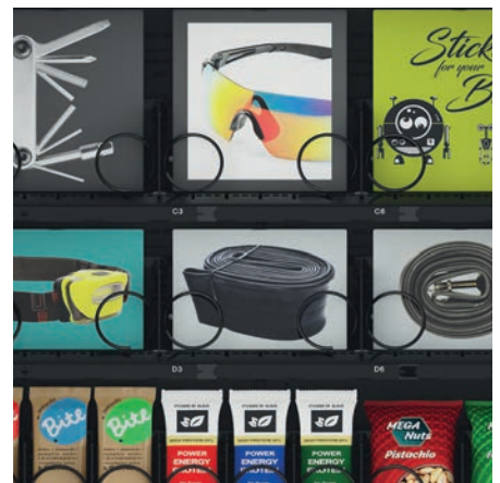
Offer a range of suitable items when the shop is closed.