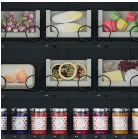
Seasonal fruit and vegetables can be dispensed e.g. or ready meals and more by the SiLine® Outdoor

*Dependant on site conditions there may be some variations, avoid direct sunlight